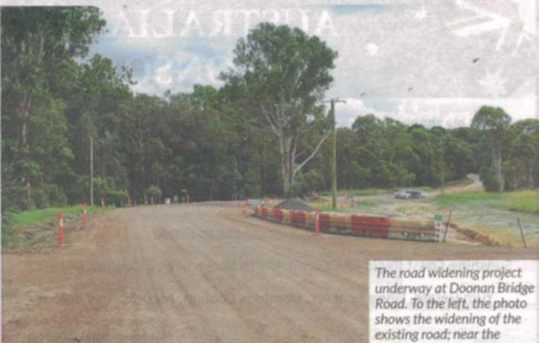
The road widening project underway at Doonan Bridge Road. To the left, the photo shows the widening of the existing road; near the centre is a tree preserved due to significant rock formations at its base, and to the right of the tree is the residents' preferred new road route that is now the site of a widened drainage channel.